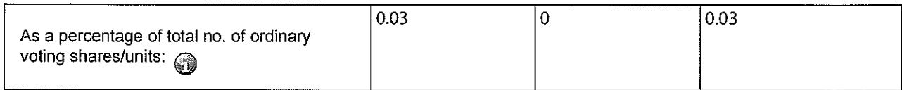
Table 3. Change in respect of rights/options/warrants over shares/units of Listed Issuer