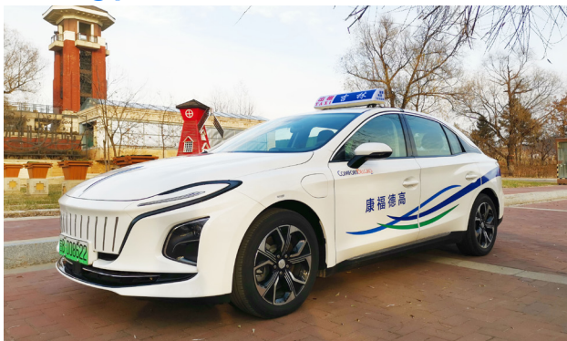
Jilin ComfortDelGro Electric Taxi.

While rail is already electric, other parts of its business – like buses and cars – are catching up. The company aims to progressively transition its bus and car fleets from 60% today to a fully cleaner energy fleet in 2040.