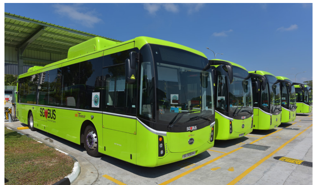
SBS Transit Electric Buses

ComfortDelGro is currently conducting trials in regenerative braking where energy from braking trains is recaptured and made available to nearby accelerating trains. This approach can save up to 3,000 megawatt-hours of energy annually – enough to fully charge around 100,000 electric cars and help to improve energy efficiency and power quality across the system.