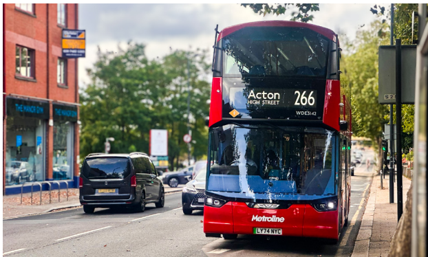
Metroline London electric bus.

In Singapore, its Maintenance and Engineering Centre serves as a centralised hub to aggregate and monitor data from several condition monitoring sources installed across its rail assets. Proprietary tools such as 4Sight and 6Sense synchronise and analyse incoming data to help identify issues early, improve troubleshooting to avoid unnecessary part replacements, and optimise maintenance cycles. This results in reduced asset downtime, fewer materials used, and more reliable service.