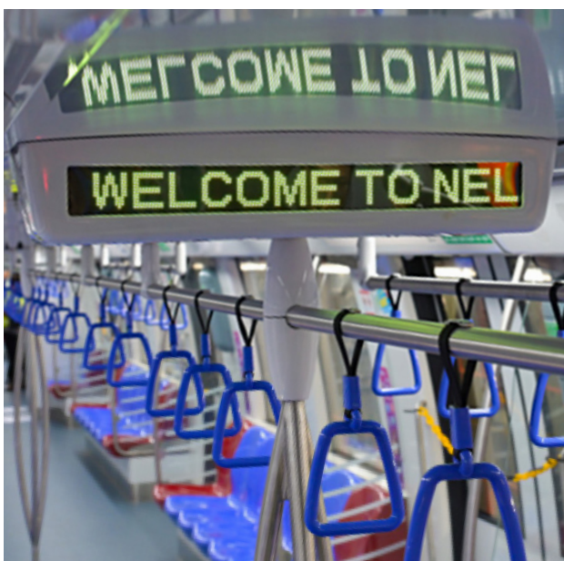
The interior of SBS Transit's North East Line (NEL) train.

As cities race towards net-zero goals, rail is emerging not just as a mode of transport but as a critical part of how cities reduce emissions. Electrified rail networks offer a cleaner alternative to private vehicles and reduce road congestion, local air and noise pollution – factors that improve liveability. Per passenger-kilometre, rail is also more energy-efficient than road transport, helping cities to cut emissions faster.