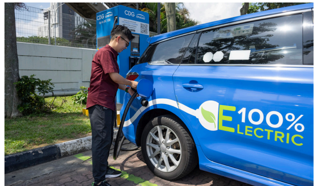
A 100% electric ComfortDelGro Taxi charging at one of CDG ENGIE's charging points.

While rail is already electric, other parts of its business – like buses and cars – are catching up. The company aims to progressively transition its bus and car fleets from 60% today to a fully cleaner energy fleet in 2040.