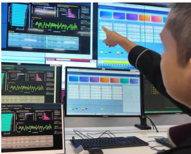
SBS Transit’s MEC collects and analyses data across various rail assets to monitor each train’s operational readiness.

Modern CCTV systems now help to automate the detection of track intruders, improving safety for both staff and customers. “These advancements are what clients expect from us as a leading operator and we are committed to delivering solutions that make operations safer, more efficient and cost-effective,” said Sim.