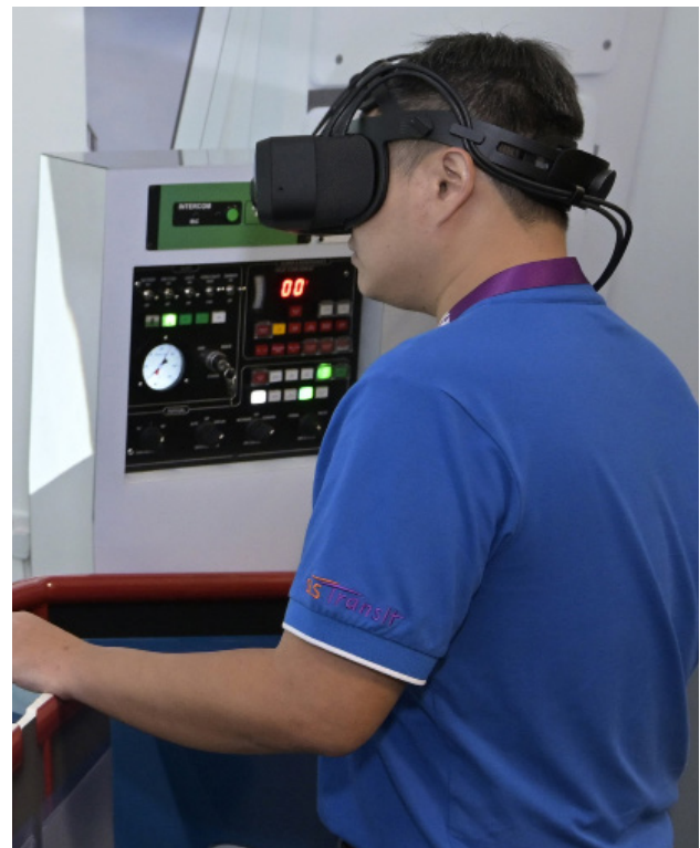
SBS Transit uses high-resolution simulations and immersive virtual reality for staff training, enhancing preparedness in a safe and controlled environment.

“Mixed reality visualisations allow us to improve safety habits and replicate best practices in the field.”