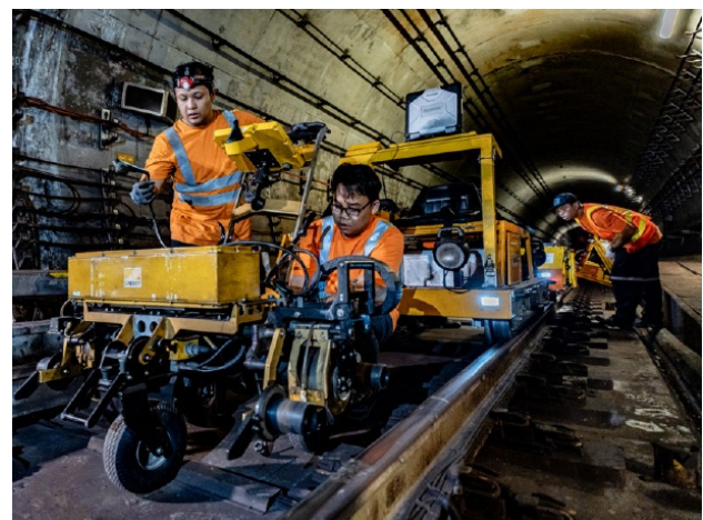
SBS Transit's multifunctional track trolley, RailRover, which can detect cracks in tracks and water leaks in tunnels.

The results consistently show up in the numbers. The Downtown Line (DTL) continues to lead and set benchmarks within the official "uptime" statistics, achieving over 8 million train kilometres between failures, as per the most recent Land Transport Authority of Singapore's data. Both the DTL and NEL have seen incremental improvements in reliability, and no more than one network outage per year that exceeds five minutes.